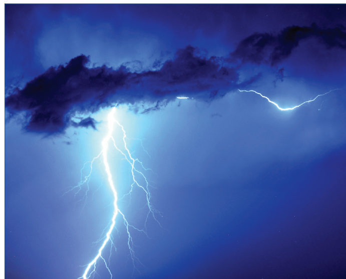
Protection from the Severest Environment