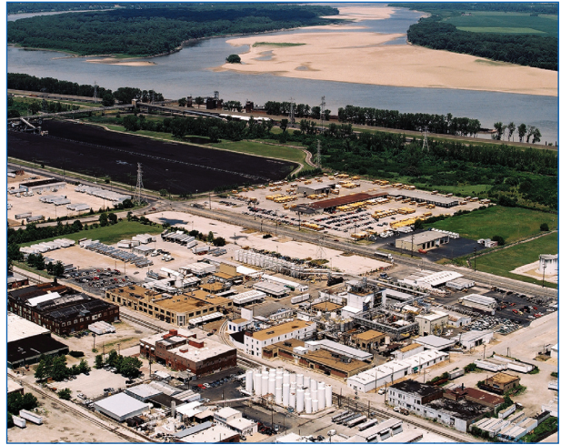
ELANTAS PDG, Inc. headquarters in St. Louis, Missouri

ELANTAS Electrical Insulation companies are strategically located throughout the world to meet the primary insulation, secondary insulation and electronic and engineering materials needs of our customers.