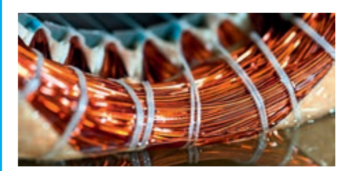
Resins for universal use

Innovative Secondary Insulating Materials