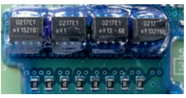
Surface Mount Adhesive